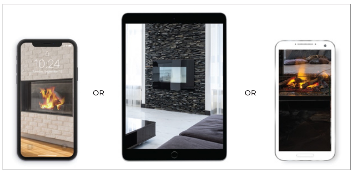
Apple iOS10 - iPhone 7/7+ / 10X/11/12/13